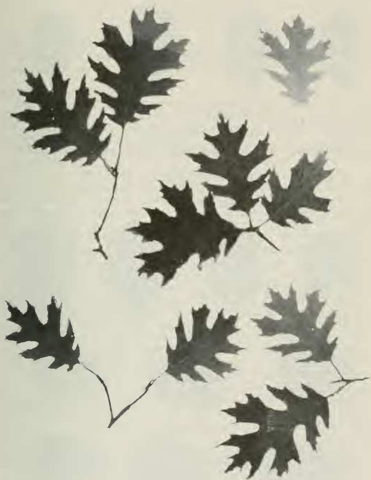
LEAVES OF QUERCUS SHUMARDII STENOCARPA #2